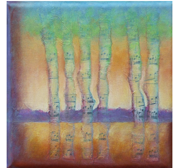
“Theme and Variation #4” 8” X 8” Acrylic and papers on canvas

For some ideas on creative projects, click here .