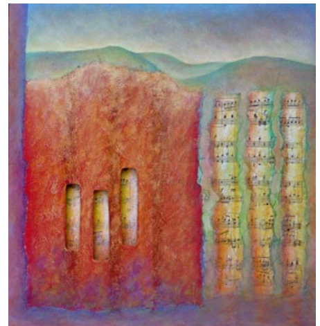
"Musical Landscape" 16" X 16"

She decided to create 100 renderings of a specific coffee cup, using many different styles and mediums. She took that cup with her wherever she travelled and drew, painted, or photographed it in a wide variety of settings.