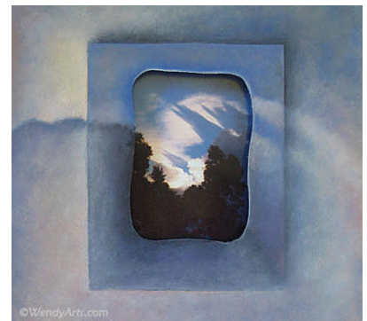
One of the E-Card Choices

A couple of paintings from the Window Series , Prayer Boxes and more are now hanging at The Spa at Pajaro Dunes .