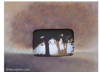
One of the E-Card Choices

You can send free e-cards to friends and family from www.WendyArts.com .