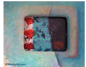
One of the New E-Cards

The Silhouessence Series will be hanging at the Pajaro Dunes Fitness Center by mid December.