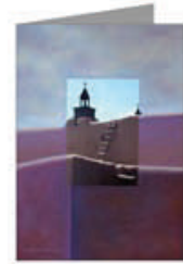
"Mission Vision" Cards (blank inside)

I loved the very small translucent envelope attached to the background. It seemed like it held a secret message inside. The elegant heart stickers, decorating the tiny envelope, completed the great overall effect.