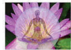
"I am the Lotus" Cards (blank inside)