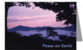
"Peace on Earth" Cards (blank inside)

That is why this issue is devoted to our connections with one another through greeting cards.